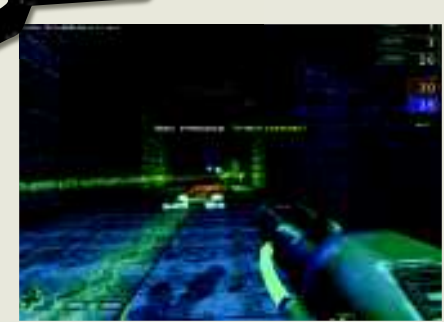
>> Deathmatch Kill them before they terminate you, unless they're on your side. In which case, give the enemy a good trashing together.