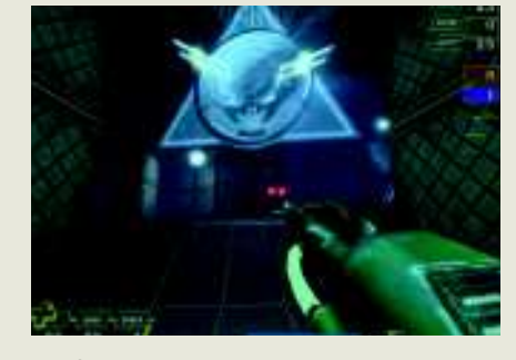
Capture the flag Grab their glowy thing and take it back to where your thing lives. If they steal yours first, kill them and get it back pronto.